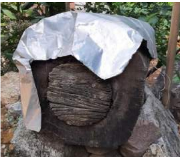
A. Traditionally made from a tree trunk