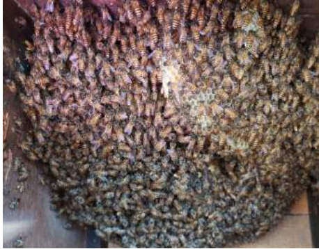
A. Bee hive