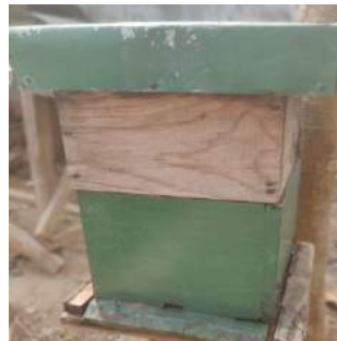
C. Khadi box