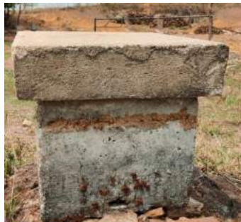
B. Cemented box