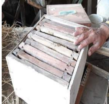
B. Compartments of Khadi