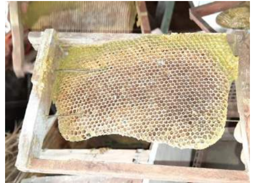
C. Honey comb of old hive